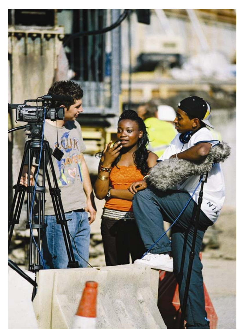
MAYOR OF LONDON